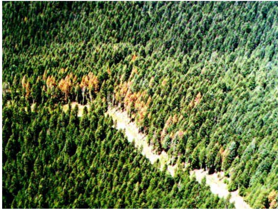
Figure 1 —Grand fir killed by the fir engraver during the 1974 outbreak on the Nezperce National Forest in Idaho.