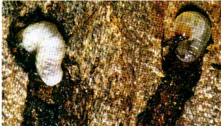
Figure 6 -- Larvae at the end of their galleries beneath the bark of a California red fir.

Four to six days after the female begins boring the egg gallery, a yellowish-brown discoloration appears on the surrounding area. The stain is caused by the fungus Trichosporium symbioticum Wright, which is carried by the beetles.