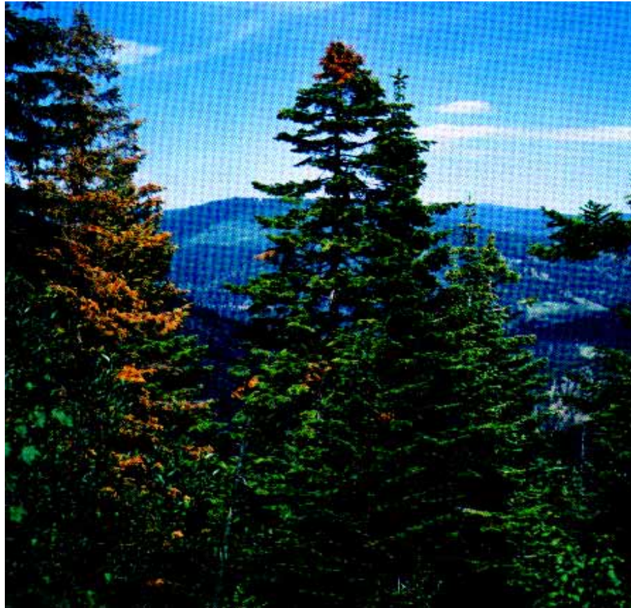
Figure 4 —A group of grand firs in Idaho displaying the variety of attack patterns that characterize the fir engraver. One tree has lost its top and some branches; its neighbor has been killed.

that are often formed when bark beetles attack pines are not produced on firs.