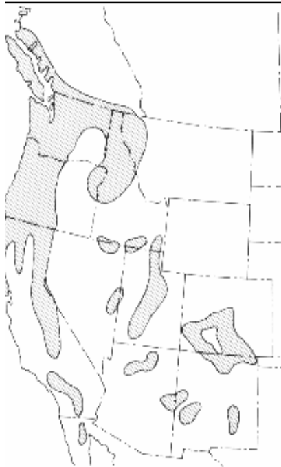
Figure 2 —Distribution of the fir engraver.

severe. In New Mexico, some 37,000 trees were killed in 1954 on about 700 acres (2,800 ha) in the Cibola National Forest.