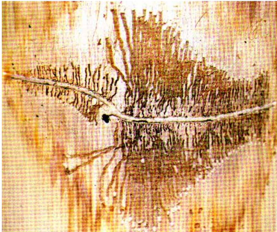
Figure 3 -- An egg gallery with an adult fir engraver and larvae at the end of their parallel galleries.

When fir engraver populations are endemic, trees are still killed, but losses are less severe.