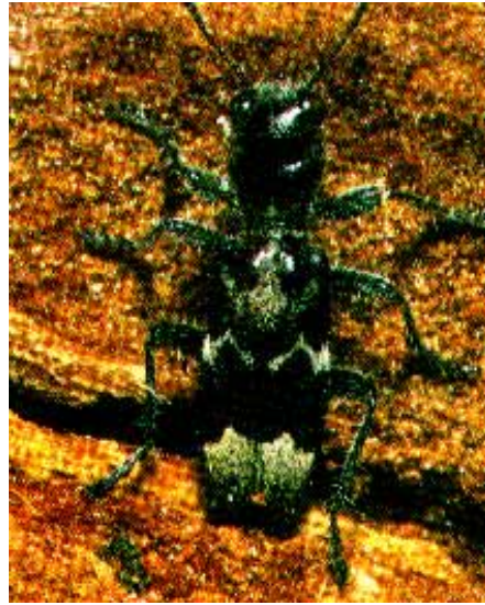
Figure 7 -- Adult black-bellied cleric (two times natural size) which feeds on larval and adult fir engravers. This cleric is also a predator of the western pine beetle.

Silvicultural practices aimed at maintaining healthy stand conditions appear to offer the best chance for minimizing engraver-caused losses. Diseased, injured, or decadent trees should be removed, and overly dense stands should be thinned to reduce tree competition.